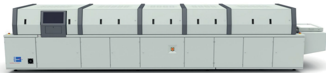
The VisionXP+ from Rehm Thermal Systems is ready for “The Hermes Standard”.