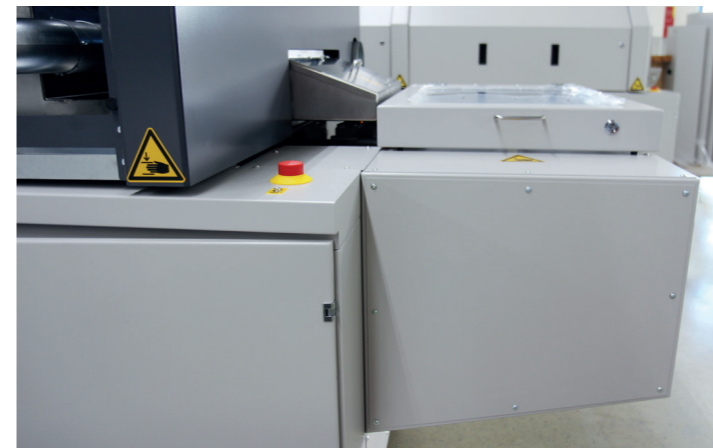
“The Hermes Standard” offers fast, network-based communication between the individual machines of an SMT line.